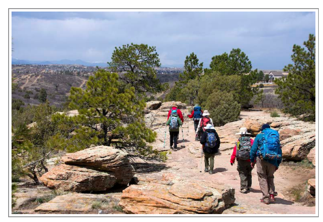
HIDDEN MESA OPEN SPACE

PS Remember to check your spam folder regularly and especially if you are expecting an e-mail from us.